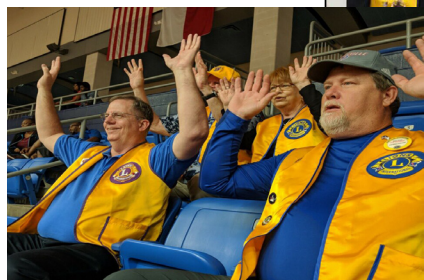
National Night Out