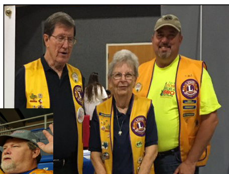
Volleyball Lions Club Night