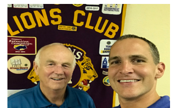
The squirrel wranglers!