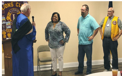
New Member Orientation 2018 - welcome to all our new Lions!