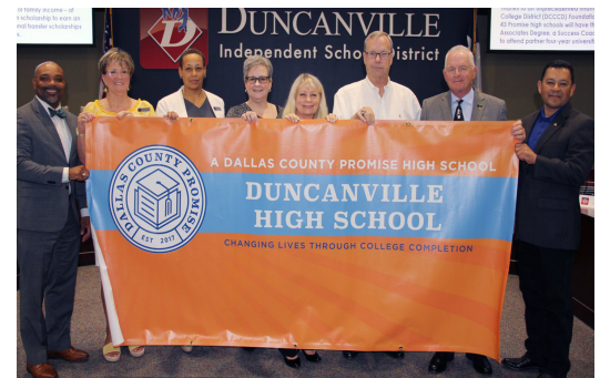
Duncanville ISD Board of Trustees & several Lions announced a partnership with @DallasCoPromise that qualifies the entire Class of 2019 to receive free college tuition regardless of family income or grade point average.