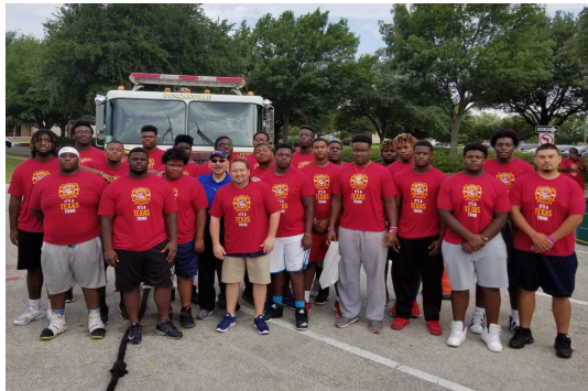
Our Lions Team (Duncanville FB Offensive Line) finished 2nd place in the annual fire truck pull.