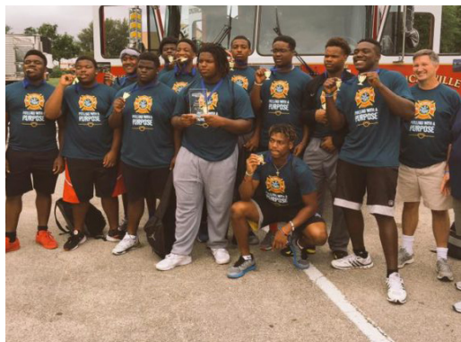
Our Lions Team (Duncanville FB Defensive Line/LBs) finished 1st place in the fire truck pull.