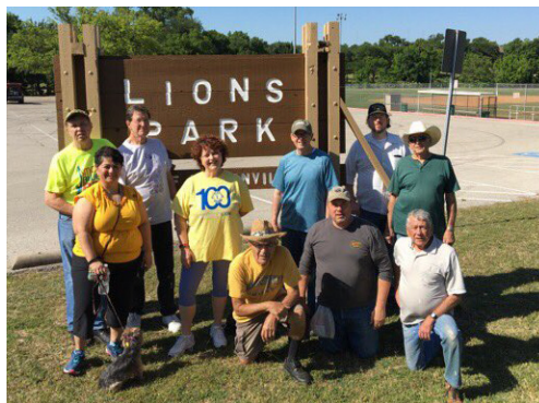
Lions Park Clean-up